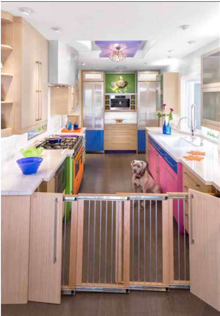
This colorful kitchen by DeWitt Designer Kitchens features a pet gate that is concealed within the cabinets when not in use.

Story by Colleen Hawkes